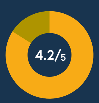
I understand my own strengths as a leader