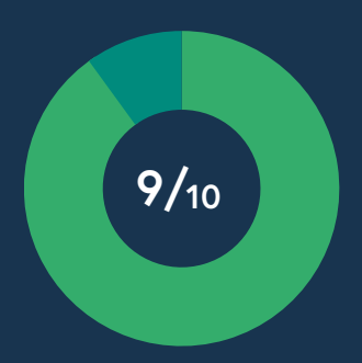
To what extent do you think volunteering in the community is important?