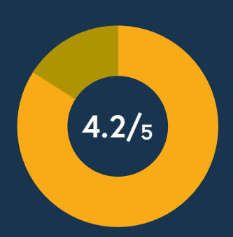
I know how to recognise others' feelings about something