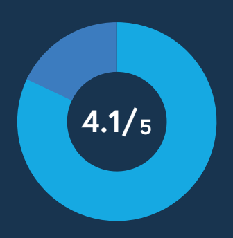
I think I know a great deal about volunteering