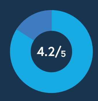
I am excited about becoming a volunteer